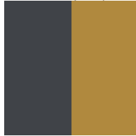
Anthracite Gray Lacquer/Gold - AGG